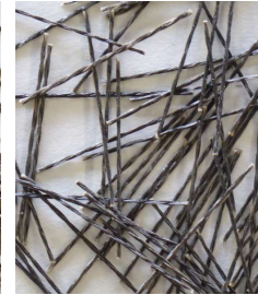
Mini Rebars twisted